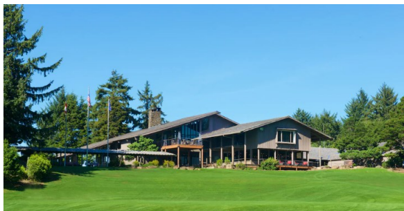
Salishan is in Gleneden Beach, south of Lincoln City